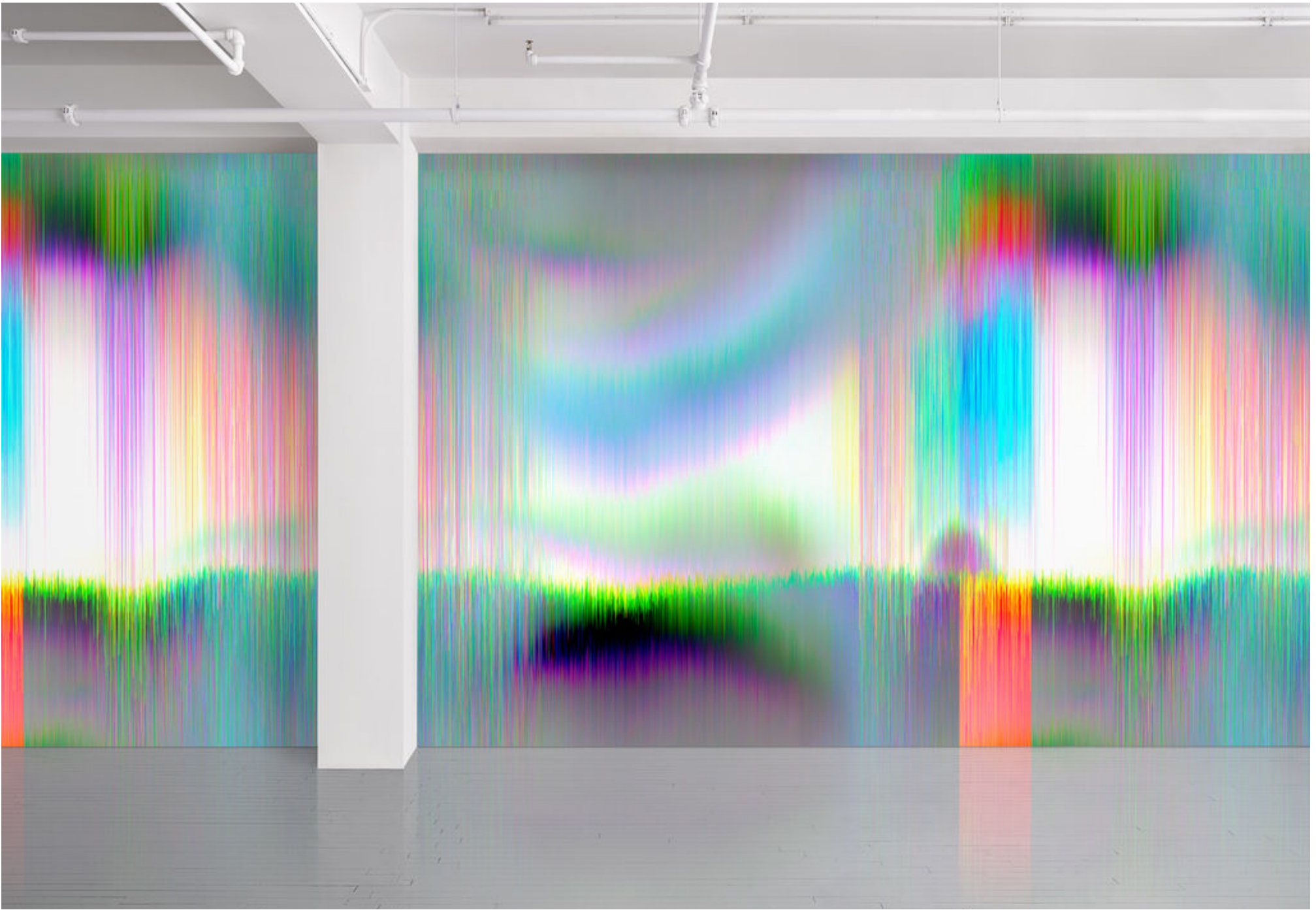
300045 Skywiper 122