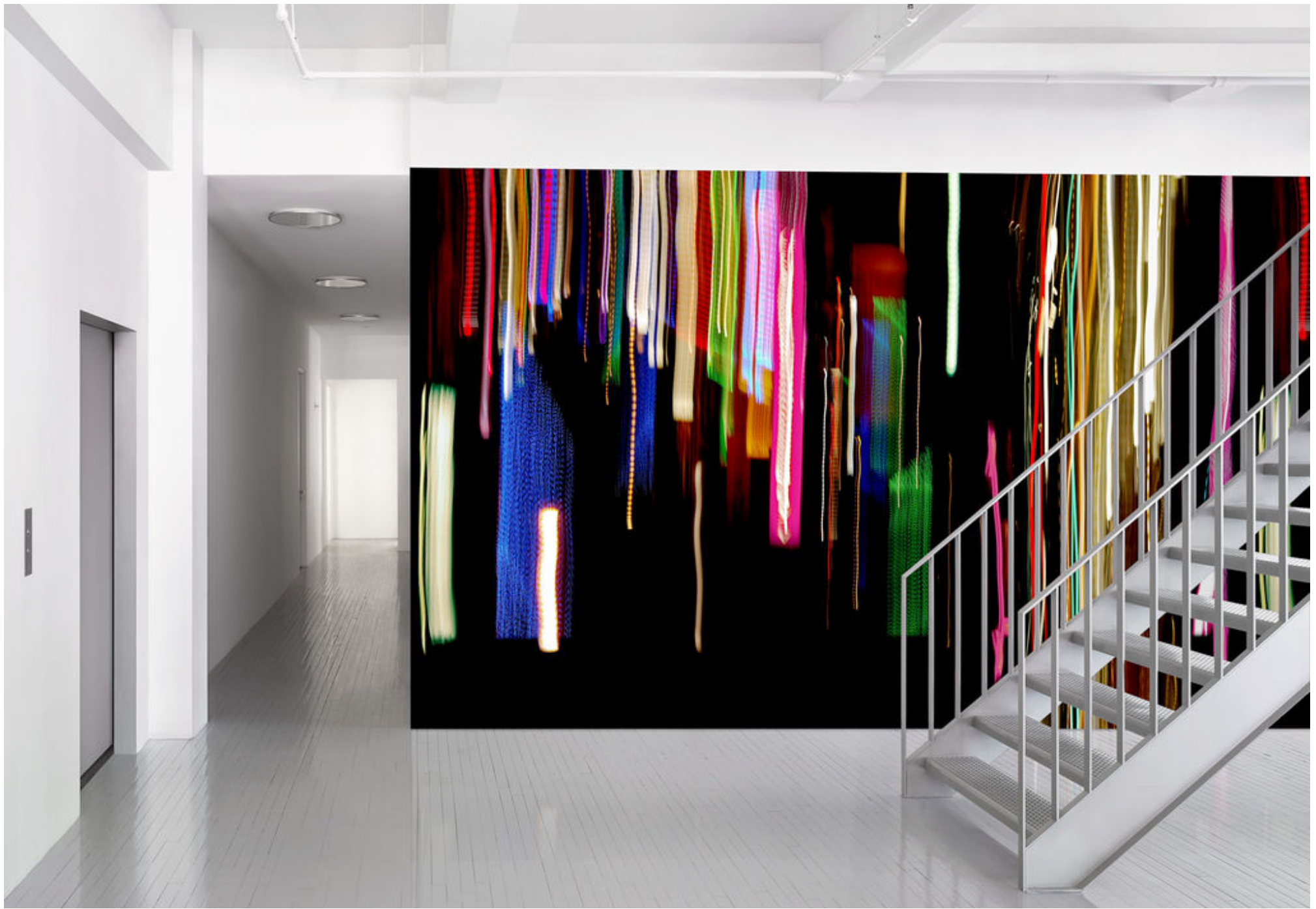
399477 Slow Exposure Stripe