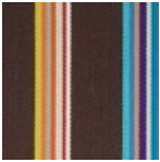
001 Rhythmic Stripe

Complete product information at maharam.com 800.645.3943