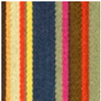
009 Rhapsodic Stripe