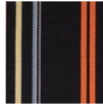
005 Intermittent Stripe