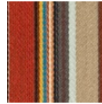
007 Harmonious Stripe