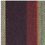
010 Melodic Stripe