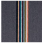
003 Syncopated Stripe