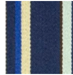
008 Staccato Stripe