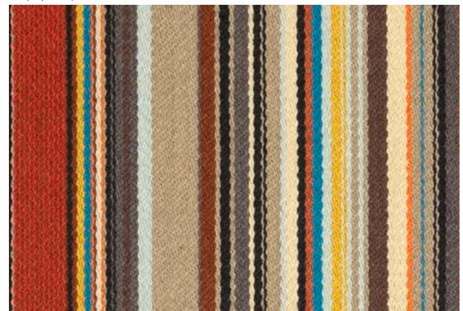
007 Harmonious Stripe