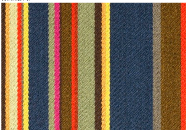
009 Rhapsodic Stripe