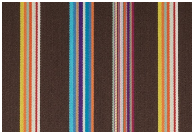
001 Rhythmic Stripe