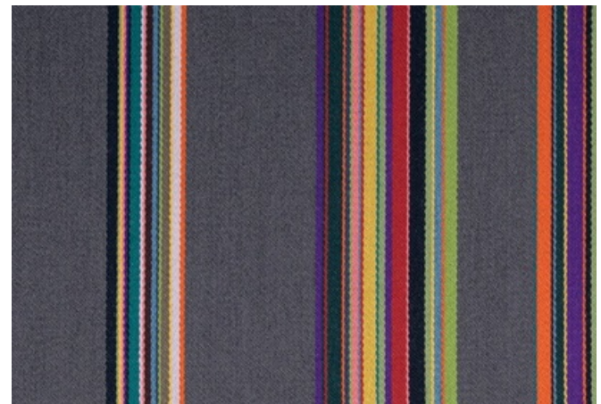
003 Syncopated Stripe