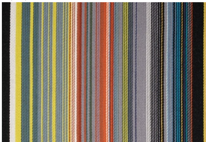
004 Reverberating Stripe