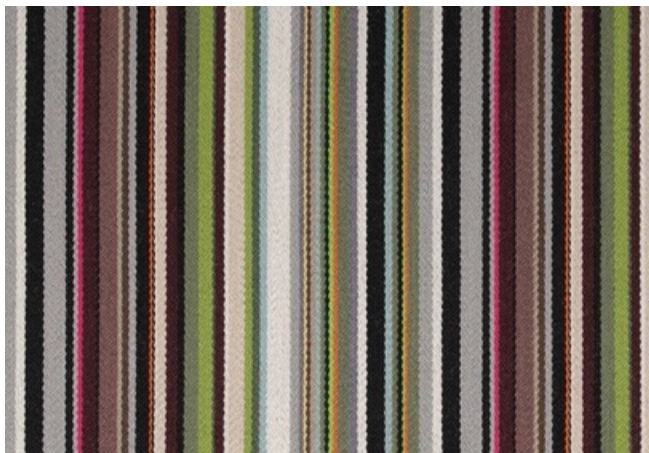
002 Modulating Stripe