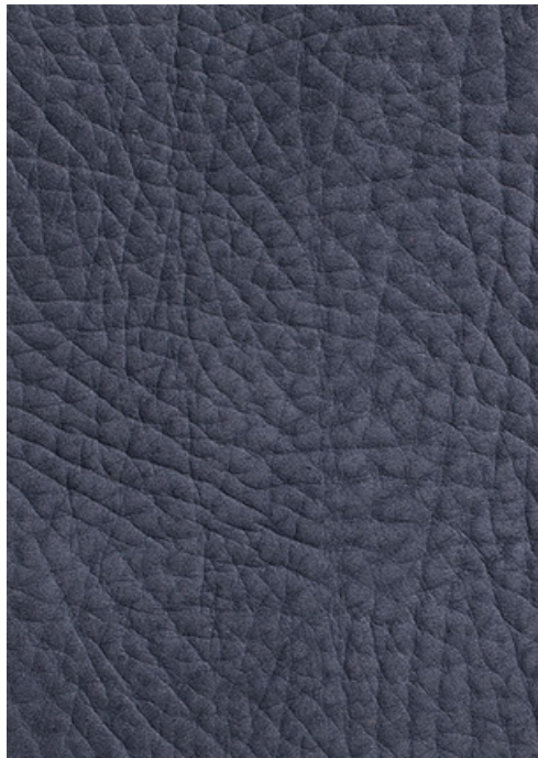
002 Coal Ash