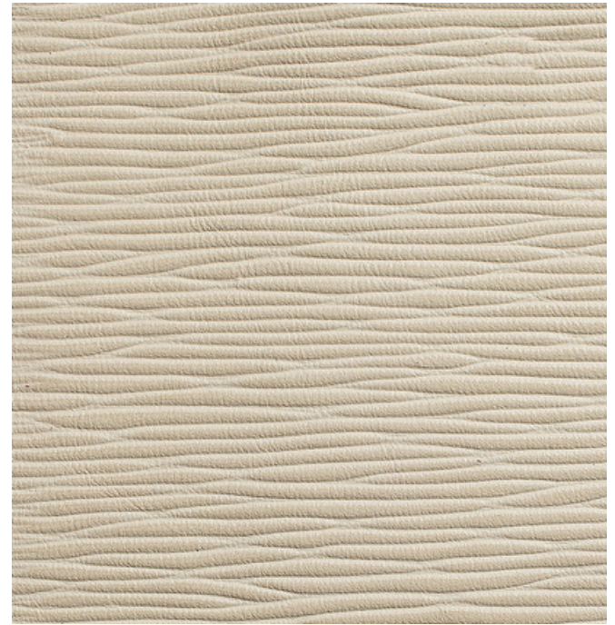
027 Antique White