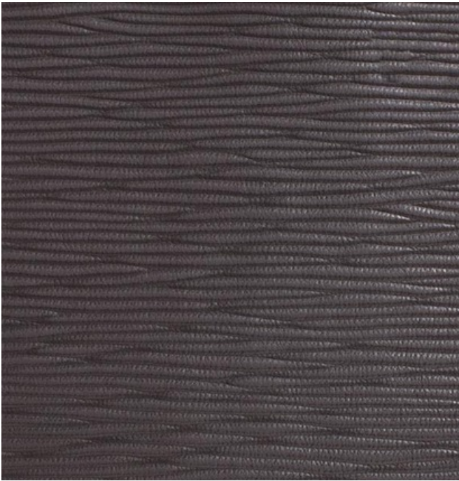
006 Grey Mare