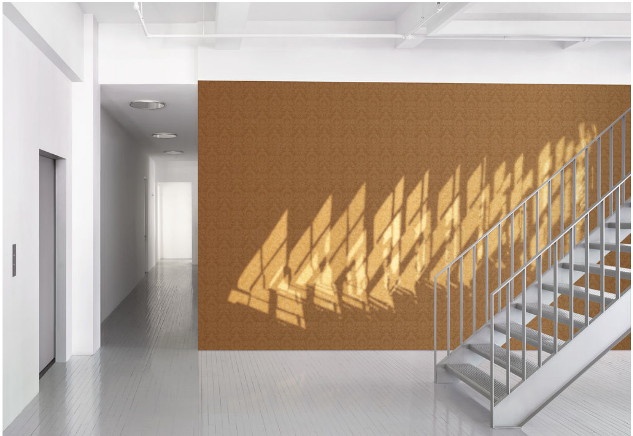
399511 Sunlight in an Empty Room (Emily Dickinson's Bedroom)