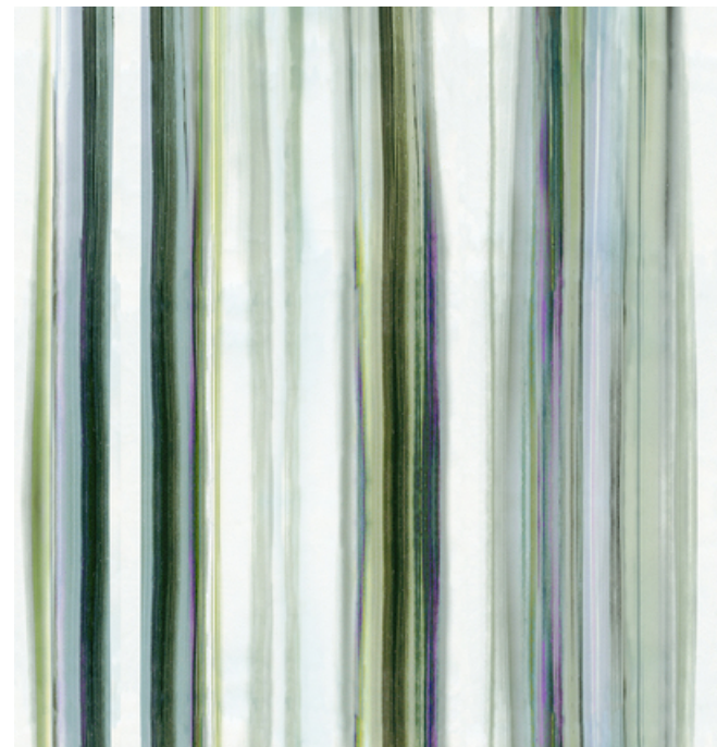
003 Evening Tide