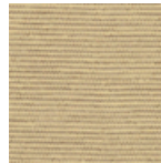
005 Flax Seed