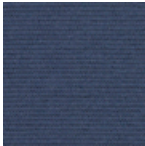
016 Deep Sea