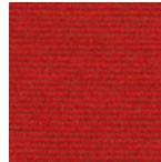
012 Knoll Red