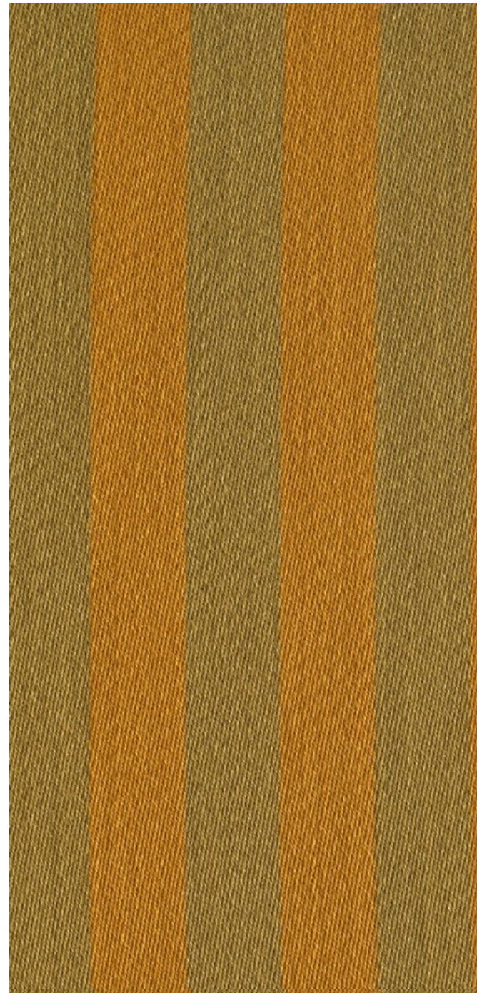
003 Ochre Dark/Sienna

462260 Toostripe by Alexander Girard, 1965