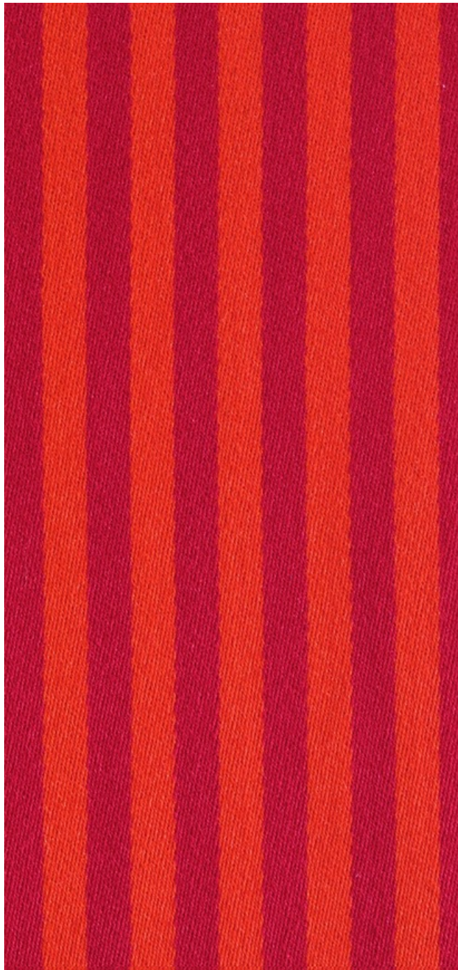
001 Orange Dark/Crimson Dark