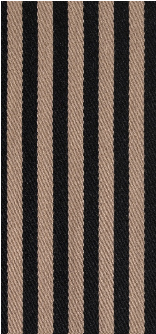
002 Black/Raw Umber