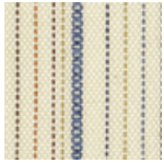
001 French Chalk