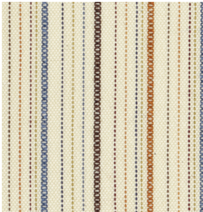
001 French Chalk