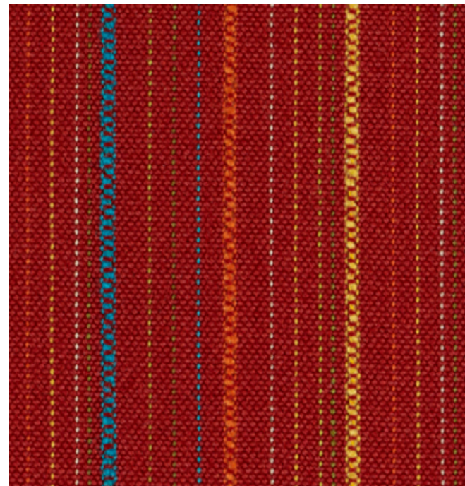
004 Venetian Red