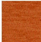
004 Autumn Leaf