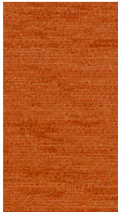
004 Autumn Leaf