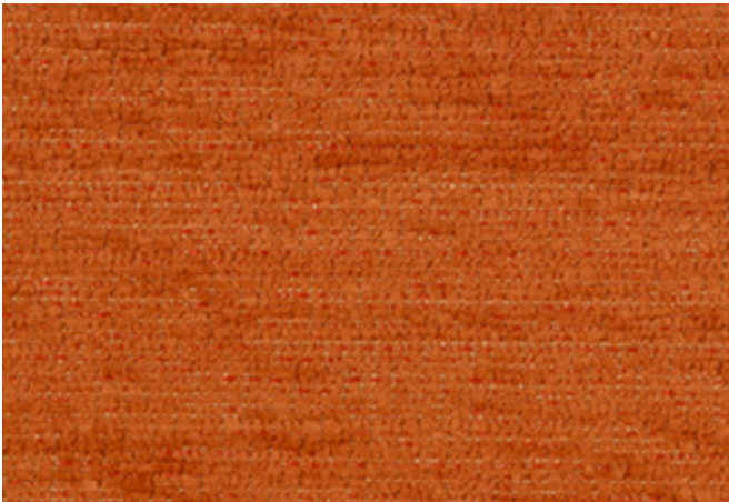
004 Autumn Leaf