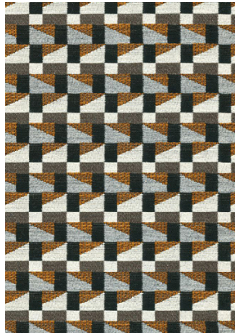
007 Ink Brush