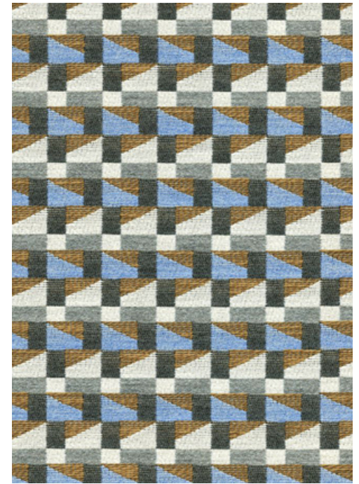
004 Sea Breeze