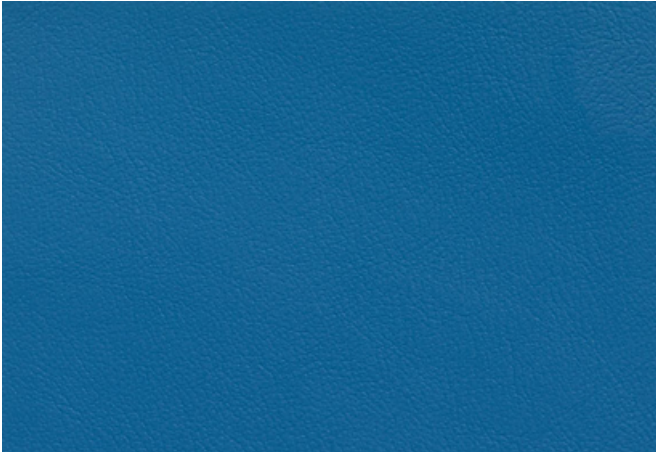
005 Blue Jay