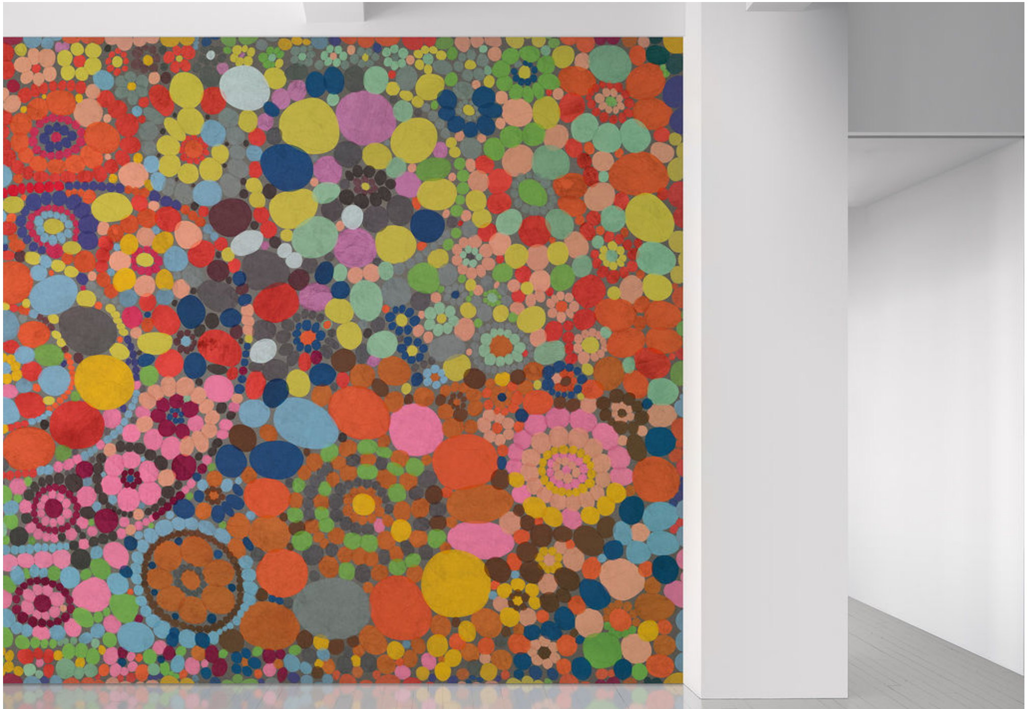
300030 Water Pebbles