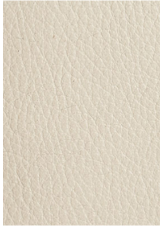
012 Grey Oats