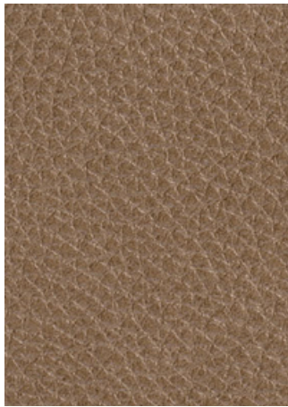
007 Wheat Berries