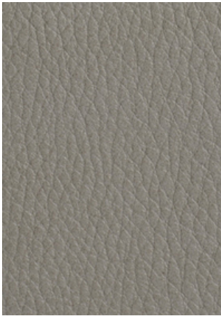
018 Grey Flannel