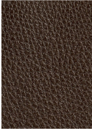
011 Chocolate Rye