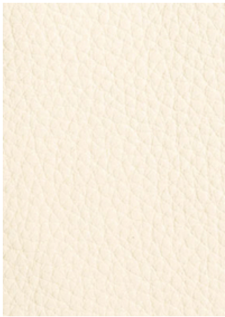
001 Mythic White