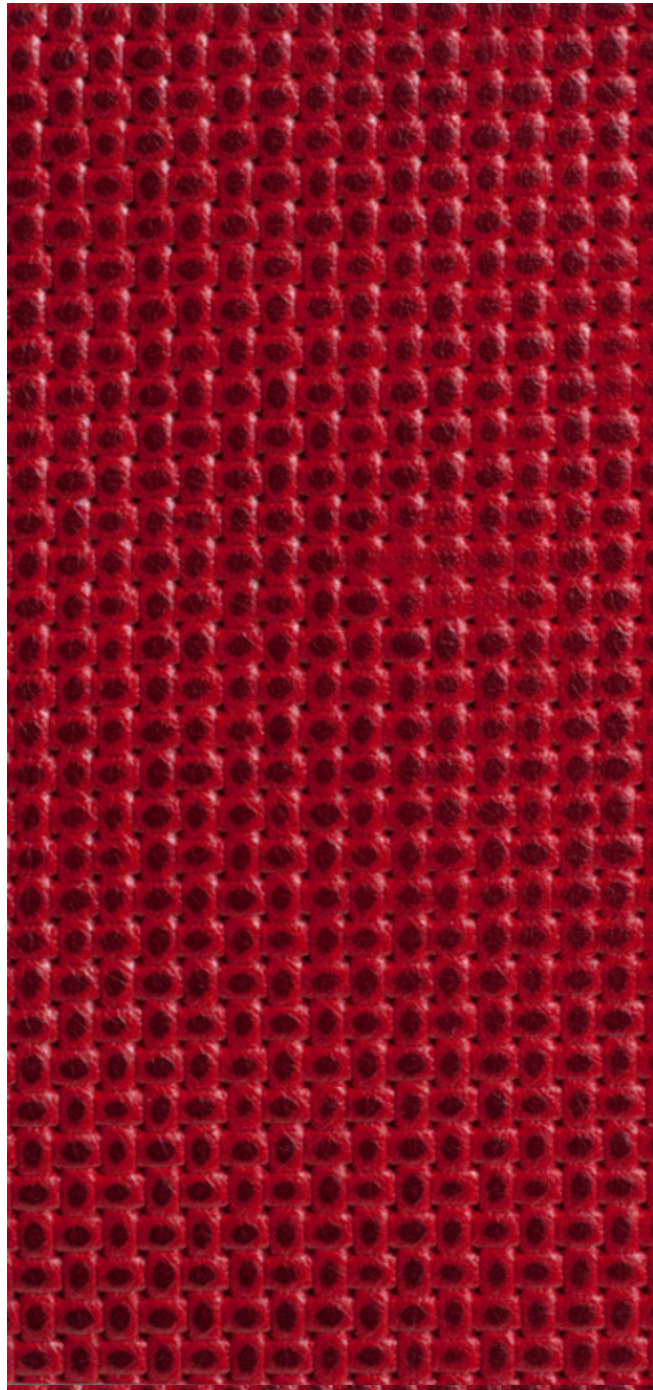
004 Cherry Royale