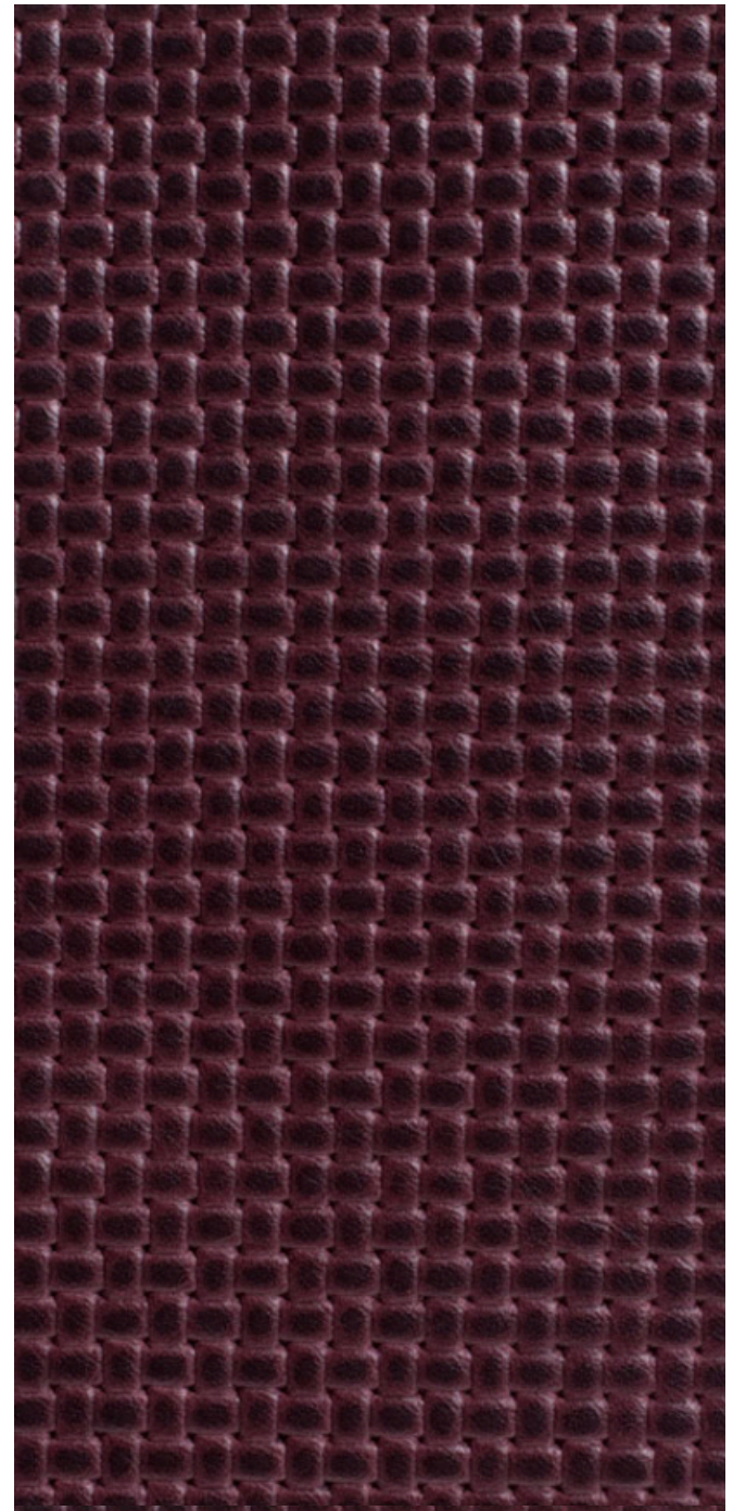
006 Bitter Chocolate