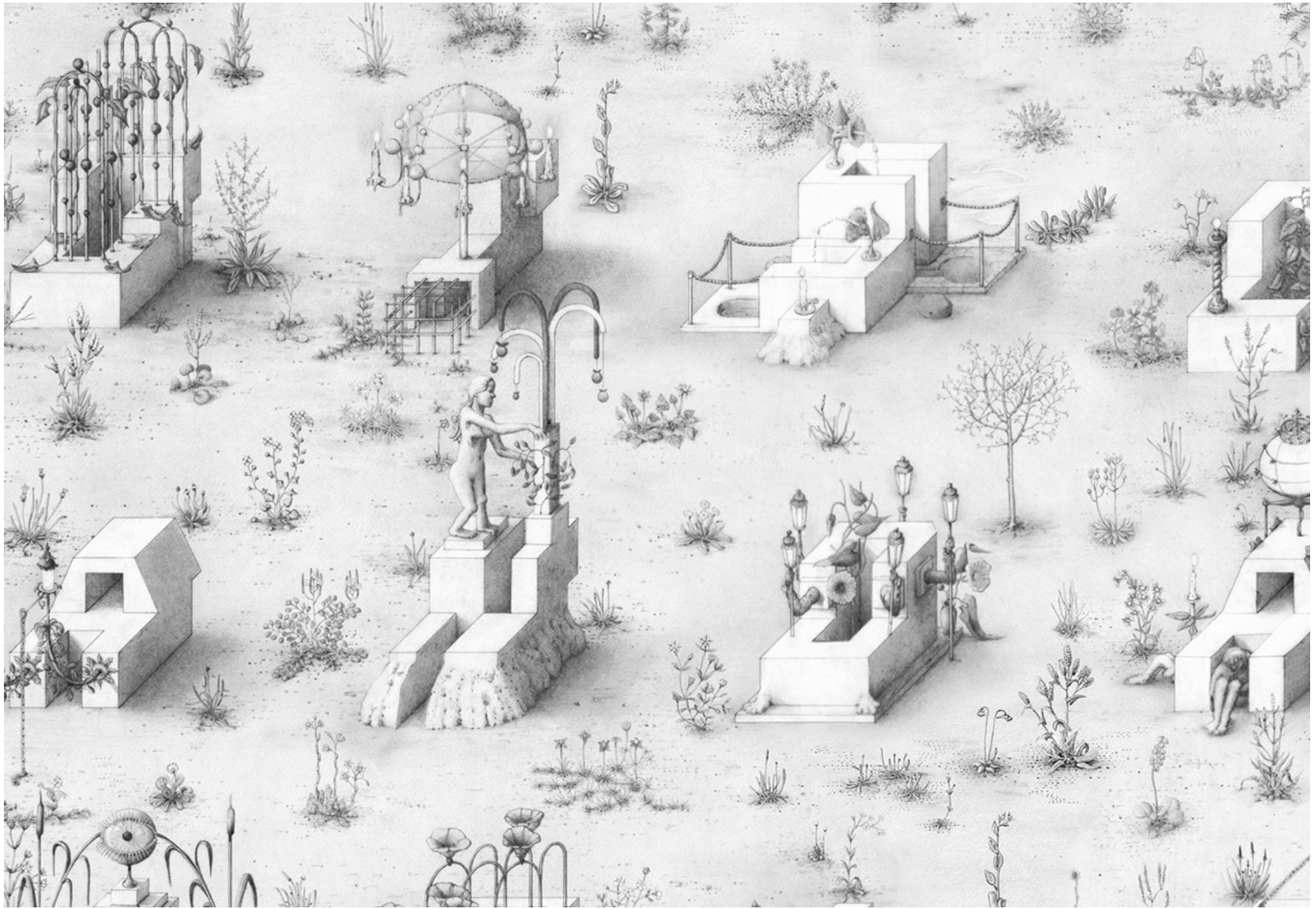
399472 Ye Olde Ruin (One)